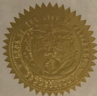
Luke Bronin Mayor

In testimony of this Proclamation, I hereby set my hand and cause the seal of the City of Hartford to be affixed this 7 th day of July, 2023.